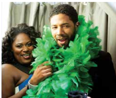
From left: Day, Barinholtz, Nanjiani and Simons tested the THR selfie stick; Empire 's Smollett (right, with Orange 's Brooks) tabbed Janet Jackson and Mariah Carey as dream guest stars for his show.