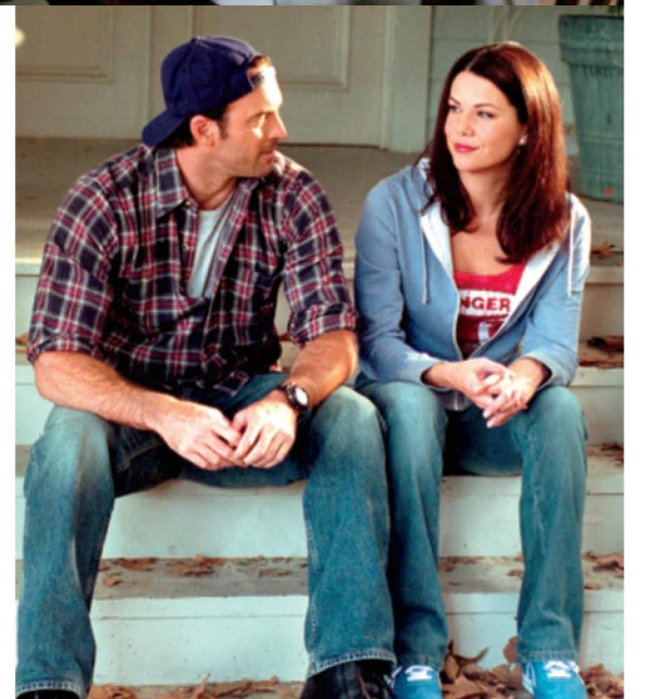
(From top) A Friday-night dinner during season 6 with Graham, Edward Herrmann, Bledel, and Bishop; Patterson and Graham in season 2

a different type of person than Lorelai; she's the type to cherish those gifts and not rebel against the more established niceties that make up their lifestyle. At the same time, Rory knows that's not really where she belongs.