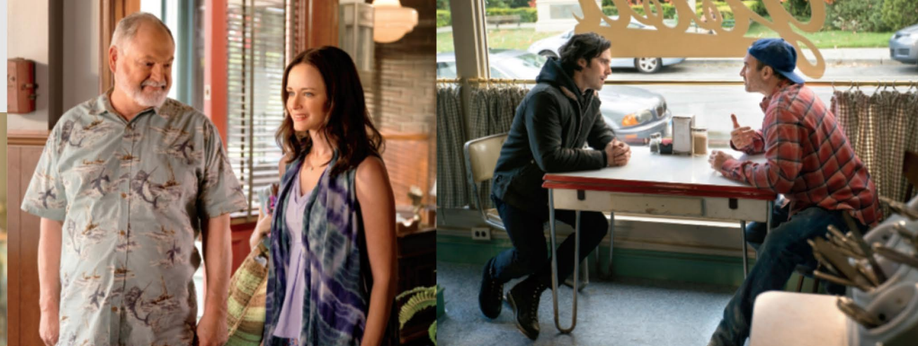
(Clockwise from far left) Scenes from the new series: Graham and Bledel; Michael Winters and Bledel; Ventimiglia and Patterson; grieving Gilmores

With that cancellation, fans were forced to accept the season 7 finale—which featured Rory (Alexis Bledel) heading off to cover the Obama campaign and Lorelai rekindling her romance with Luke (Scott Patterson)—as