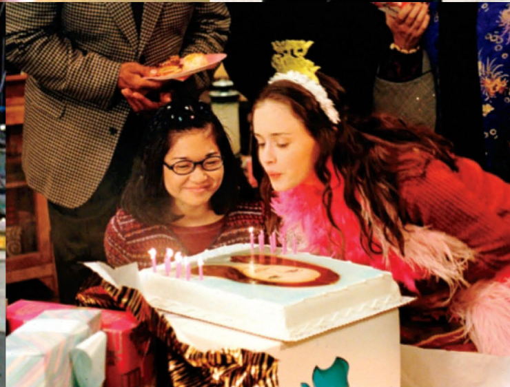
(Clockwise from top left) Rory and her gang; Bledel with Padalecki; Ventimiglia; Agena and Bledel; with Czuchry

didn't think it was something that made a lot of sense for my character. It was something I had to wrap my head around.